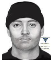
Potential Suspect Composite Sketch

Given the number of recent burglaries, please keep an eye out for any suspicious activity. If you see something, say something and report it to the Police immediately. Remember to call the Police if you will be away on vacation. Contact your district officer if you want them