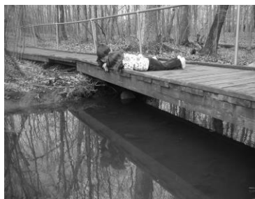
Great Swamp Reflections

Send us your Chatham Township-themed photo for possible inclusion in a future newsletter.