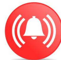
PHOTO OF THE MONTH

The Chatham Township Committee recently launched Alert Chatham Township Now! (ACT Now!) a new campaign designed to increase the number of individuals and local businesses registered for the Township's Emergency & Community Alert System. Read more about this initiative here or register and manage your existing profile here .